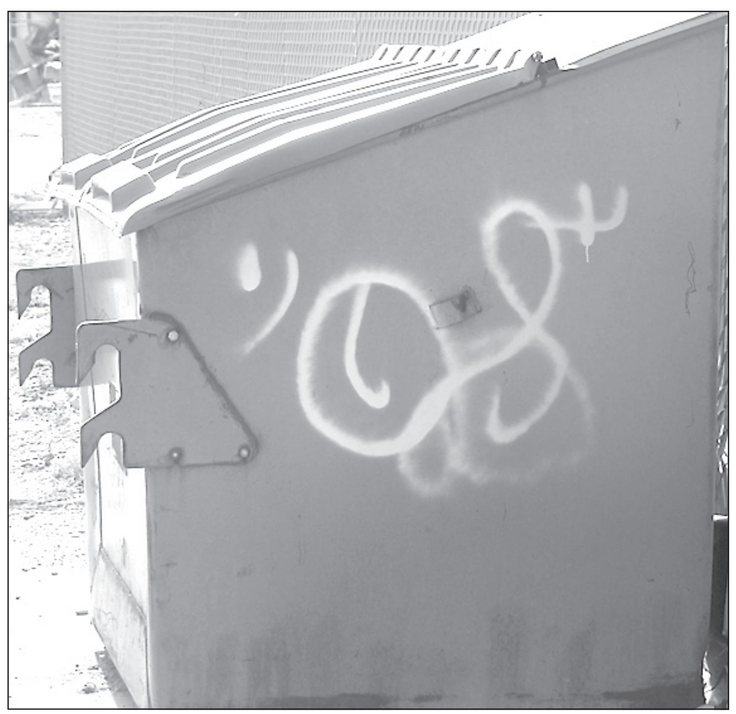
This dumpster in the alley behind the Goodland Star-News of- several nearby buildings were also tagged. fice was tagged by vandals sometime last weekend. A fence and