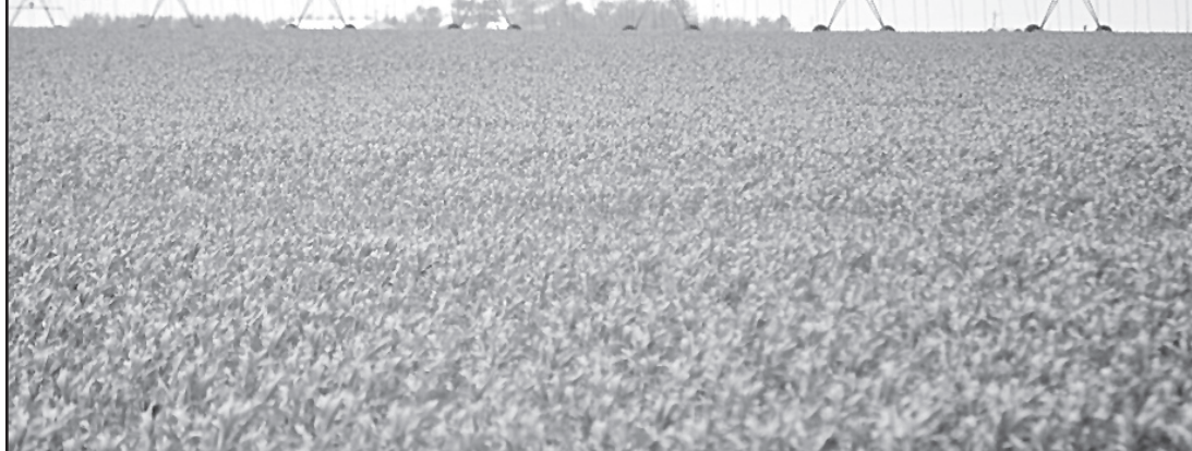
Recent rains have been good for Kansas' growing corn crop. However, the taller it gets the more susceptible it can be to wind damage. Last week, corn in Harvey County was heavily damaged by 70 mph winds.