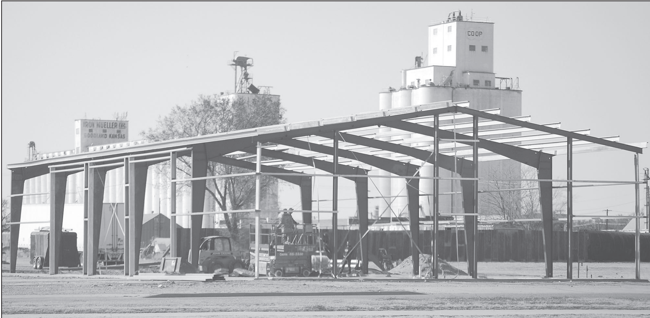
This building, now under construction on Cherry Avenue near Pizza Hut, will be an expansion of Goodland Machine and Auto Care.