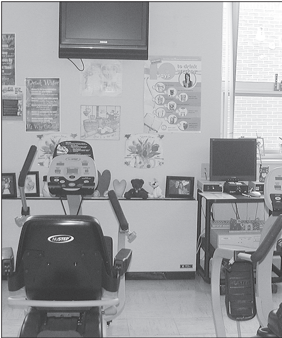
Logan County Hospital's Fit for Life program, which currently serves rehabilitation patients, has been limited to just two hospital rooms in the building. New construction will include a larger area for the program and the services will be offered to the general public.

in which they can partner with other agencies and offer their providers a chance to get outside the clinic and promote disease prevention rather than just treating illnesses.