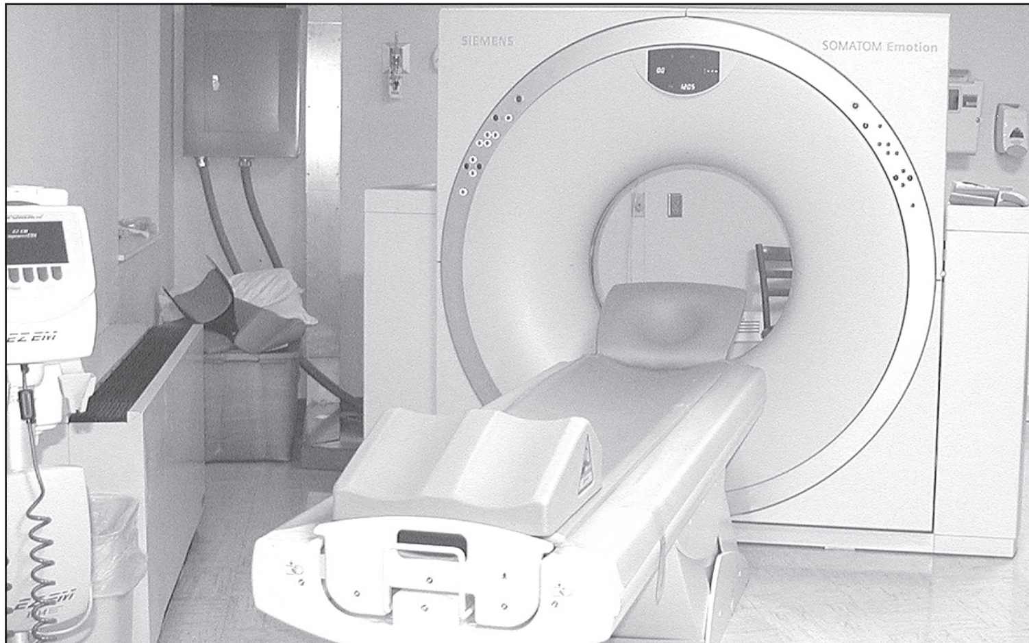
The Logan County Hospital is equipped with a CT (computer tomography) scanner, a special kind of X-ray machine that sends out several beams simultaneously from different angles to see inside your body.