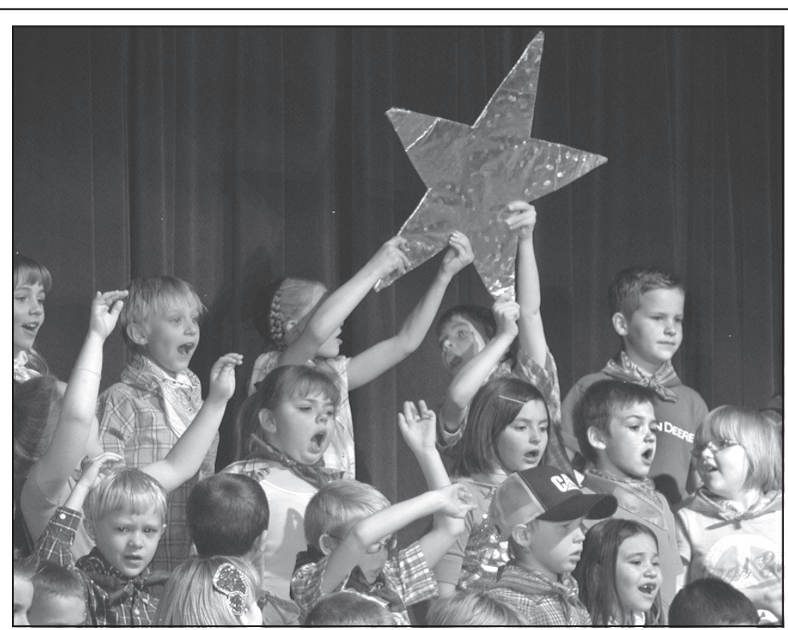
West Elementary School students held up a star while singing during the "Singing in the Country" concert on Tuesday.