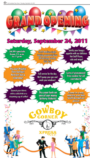
Best Grocery Ad, Cowboy Corner Xpress "Grand Opening" RAN 9/20/2011