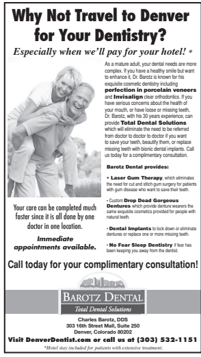
Best Healthcare ad, Barotz Dental of Denver, Colo. RAN 10/11/2011