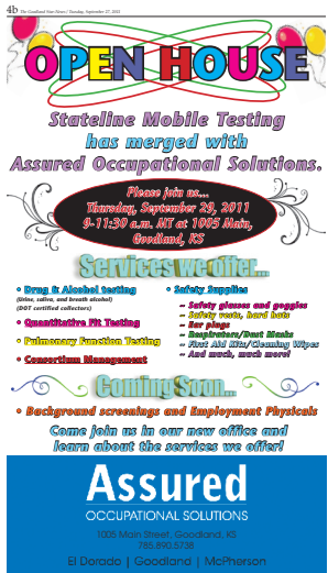
Best Professional Service, Assured Occupational Solutions "Open House". RAN 9/27/2011