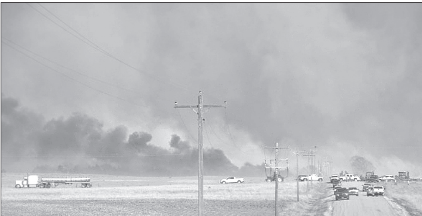
Area firefighters worked all day Sunday to try and contain a fire in Yuma County, Colo. Local farmers also brought their tractors to help fight the fire, using discs to cut barriers in the grass and crop stubble.