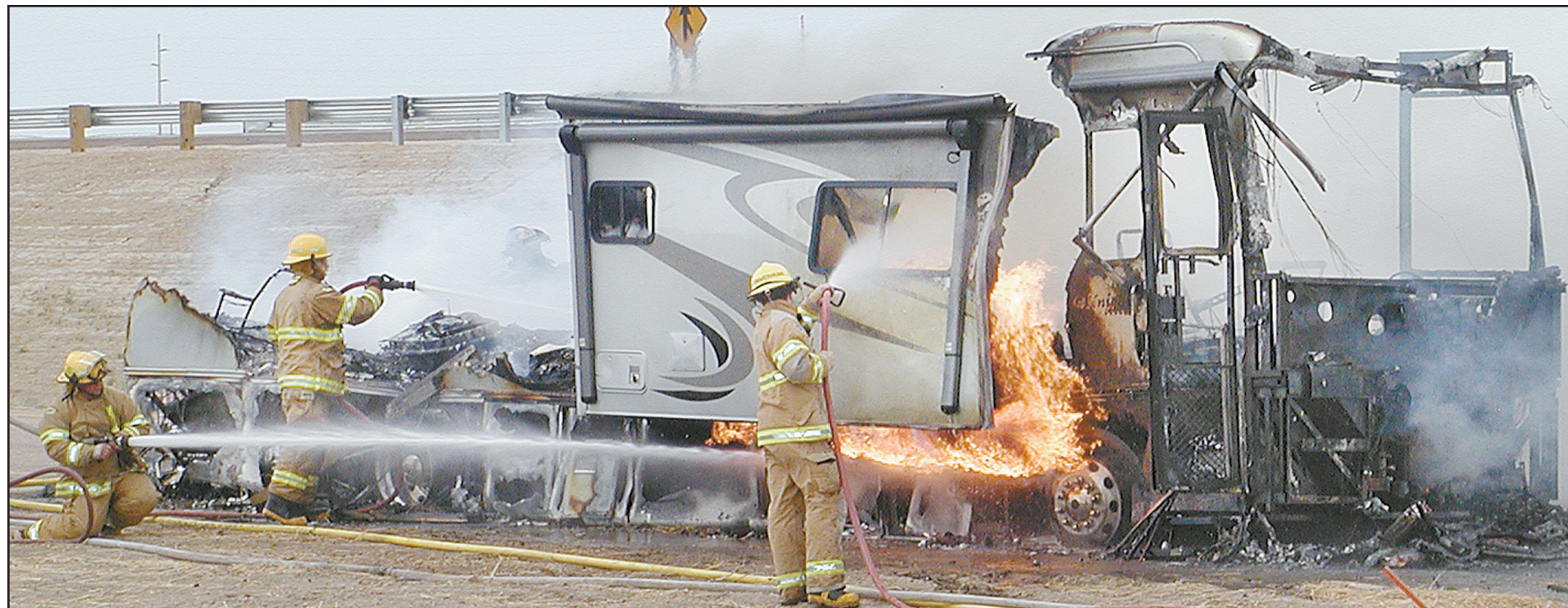
Sherman County Rural firefighters sprayed water on a burning motor home Monday afternoon on Exit 12 at Caruso. The couple from Hot Springs, Ark., escaped without injury and unhooked their car they were towing. For more pictures, see Page 5.