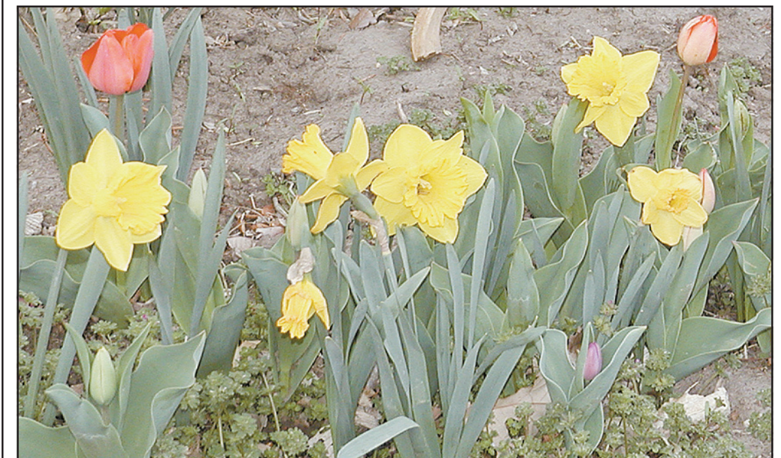
The yard of Tim McGrath at 11th and Broadway has many daffodils blooming with the tulips not far behind. The warm weather has produced an abundance of spring flowers and blooming trees.