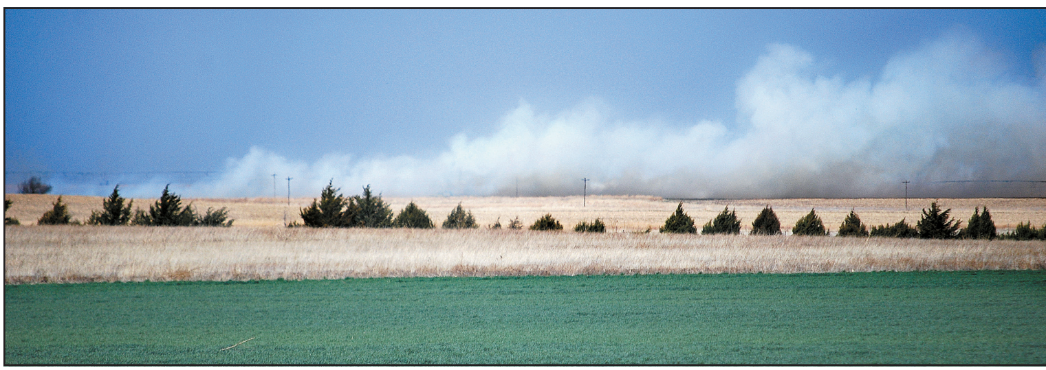
The Sherman Rural Fire Department was called to the scene of this Conservation Reserve Program grass fire several miles northwest of Goodland Monday morning, just a few hours before the motor home caught fire on I-70.

The motor home was a complete loss. The couple said they had just put new batteries in the vehicle and were having problems with a slide-out when they stopped at the exit to check.