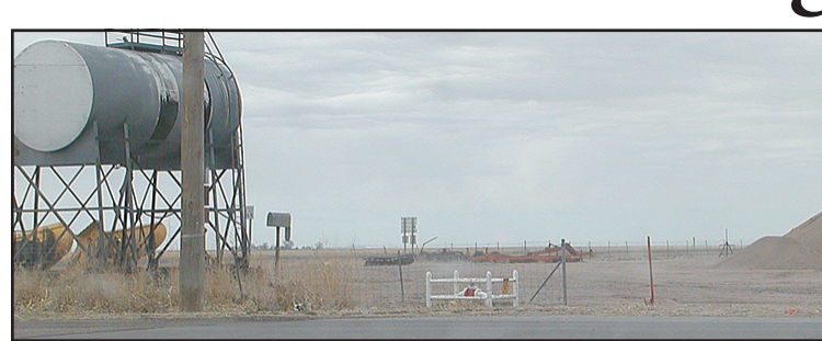
This tank sits on county land at Eighth Street and Cattle Trail, which the commissioners are considering for a new fire and ambulance station.

Eventually, the building may also house the Sherman County Rural Fire Department. The building