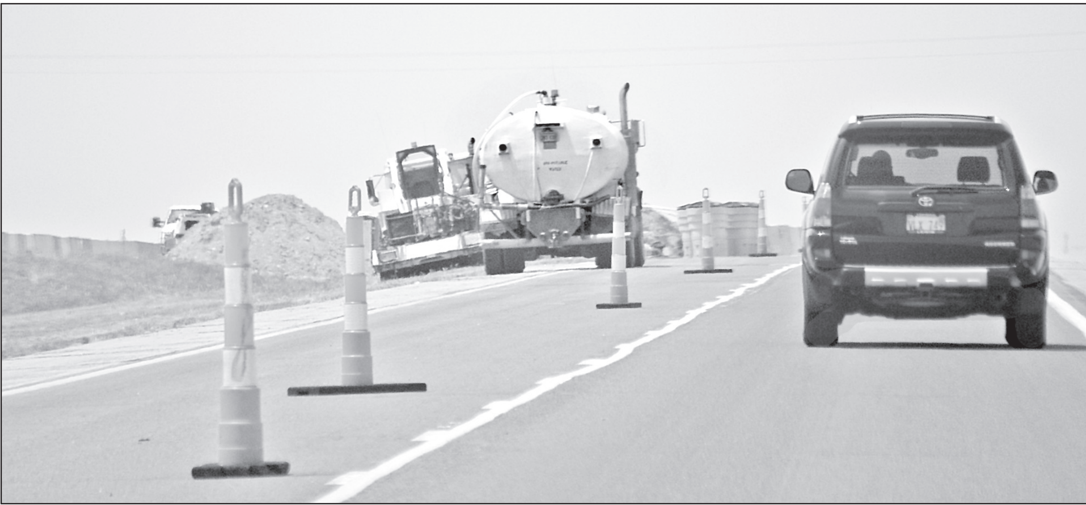
Since the arrival of warm weather road work has started in earnest. Pictured above is the work the Kansas Department of Transportation project between Brewster and Edson. Drivers need to be aware of the lower speed limits in the construction zones.