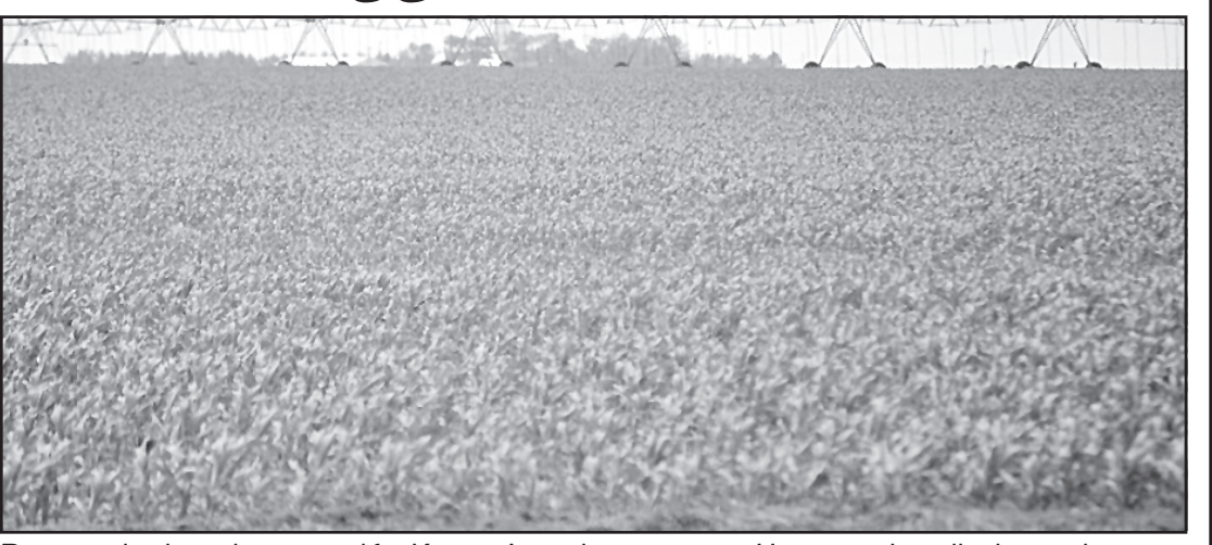
Recent rains have been good for Kansas' growing corn crop. However, the taller it gets the more succeptable it can be to wind damage. Last week, corn in Harvey County was heavily damaged by 70 mph winds.