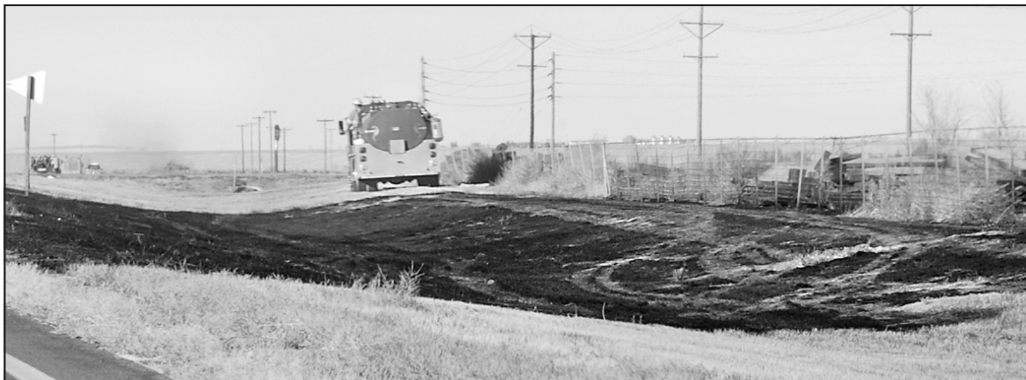
Two small sections of grass by the side of K-27 just north of the overpass in Goodland caught fire last Tuesday. Sherman County firefighters had both fires out quickly, but Chief Brian James had sheriff's deputies briefly close K-27 because blowing smoke was hampering visibility for drivers.