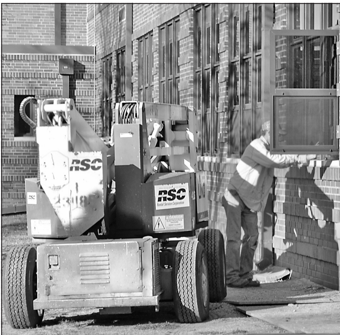
The project of replacing the old windows at Goodland High School is drawing to a close. Employees at Dependable Glass worked Friday on installing some of the last windows.