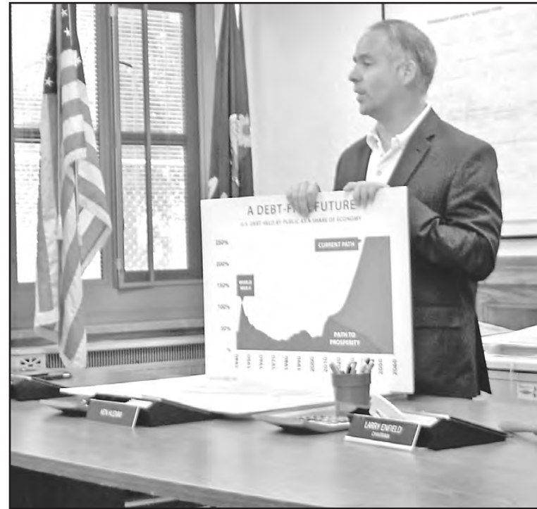
Congressman Huelskamp at the town hall meeting Monday at the Sherman County Courthouse.

Huelskamp said the wildlife service was trying to push the measure through, but there is a voluntary program that will solve the problem. He had told federal officials that Kansas has been in a drought, so it would be natural to see prairie chicken habitats on the decline, and that even then the population of prairie chickens in the state was up 30 percent. He said he was told that people have to make up the difference, and Kansas would not be given time off because there was a drought.