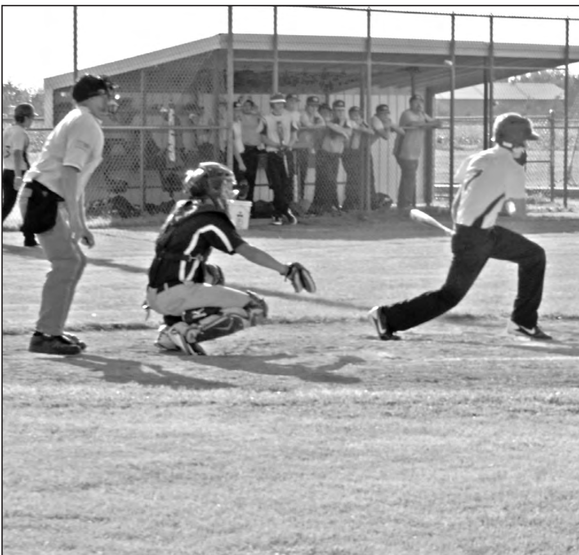
One of the members of the Goodland K-18 team taking his turn at bat in their game against Oakley on July 1.