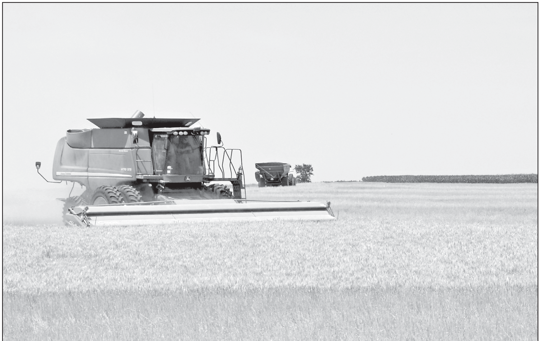
Harvest had started by the weekend in the northern part of Sherman County. Fields vary from looking pretty good to really spotty and weedy. The dry weather and the late spring freezes had a negative impact on the wheat.