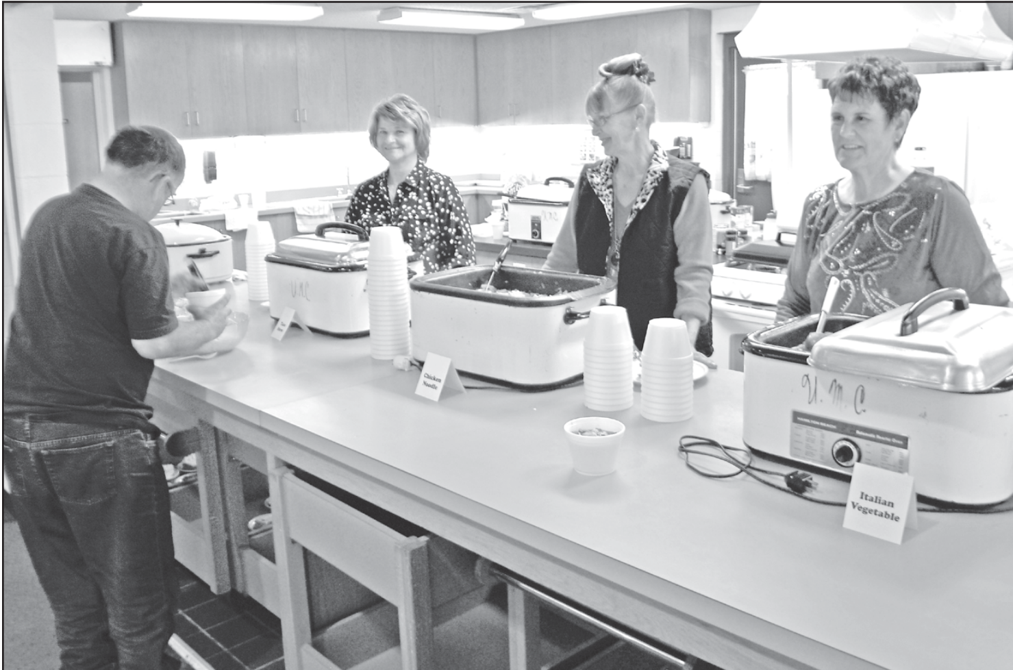
Three types of soup were on the menu Saturday at the Goodland Regional Medical Center Auxiliary luncheon fund raiser at the Goodland United Methodist Church. The auxiliary is raising money in part to go to the hospital's capital campaign, and will

be doing more events later this year. The volunteer organization helps support the ongoing needs of the hospital.