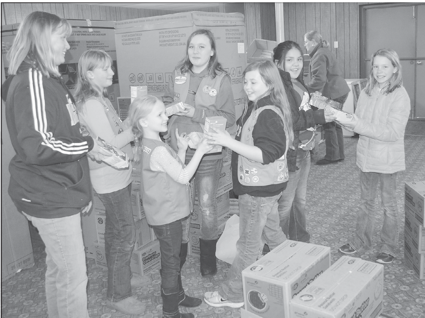
The local Girl Scouts started selling Girl Scout cookies on Friday afternoon. Scouts were picking up their cookies from the cookie warehouse at McClung's Appliances on Friday afternoon. The money the girls make for selling the cookies goes into an account where they use it for camp or other scouting supplies. If you are missed and want cookies call (785) 821-1782. They will be selling cookies until Sunday, March 9.