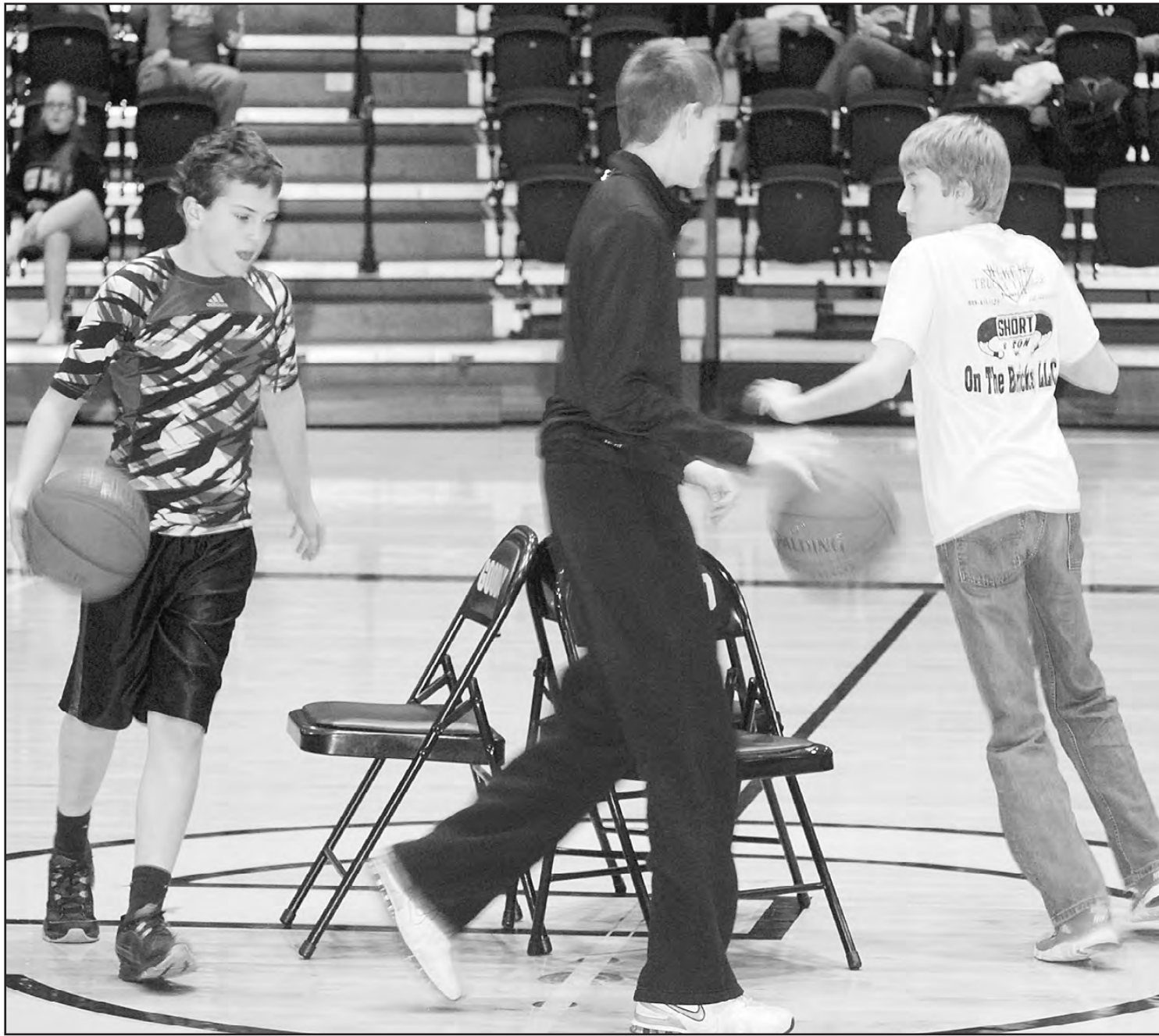
The halftime show on Friday night of the Goodland Cowboys game against Holcomb was the drawing of four people who had a chance to win money at the Musical Hoop Shoot put on by the Girls Athletic Association. The contestants circled the chairs until

the music stopped and then ran to take a shot. The last one back to the the chairs was out. The winner received $50. These three are Grant Junior High Students.