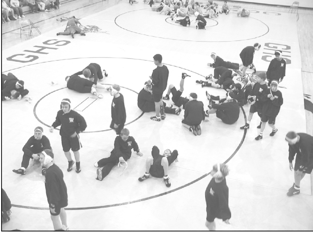
Members of the Mustang wrestling team from Grant Junior High School warmed up Thursday afternoon prior to their season-opening triangular meet against Oberlin and Quinter at Max Jones Fieldhouse. More than 80 matches took place in 20 weight classes. Grant's next action is Saturday at the Mustang Wrestling Invitational at Max Jones Fieldhouse starting at 9 a.m.