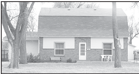
531 W. 10th St....

Spacious home! This 2 story home offers 4 bedrooms and 2 baths. The main floor has formal living room, family room, dining room, big kitchen with stove and dish-