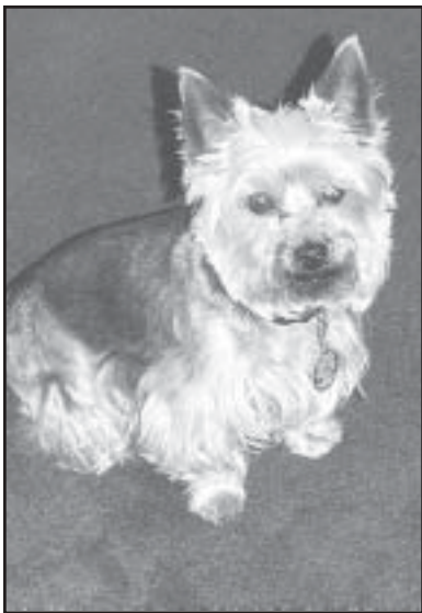
Arfy is known as the "guard dog" at Mann's Jewelry.