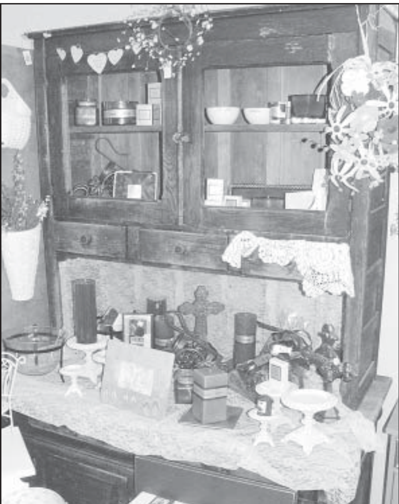
Picture frames, candles and candleholders are among the home decor items in the store.