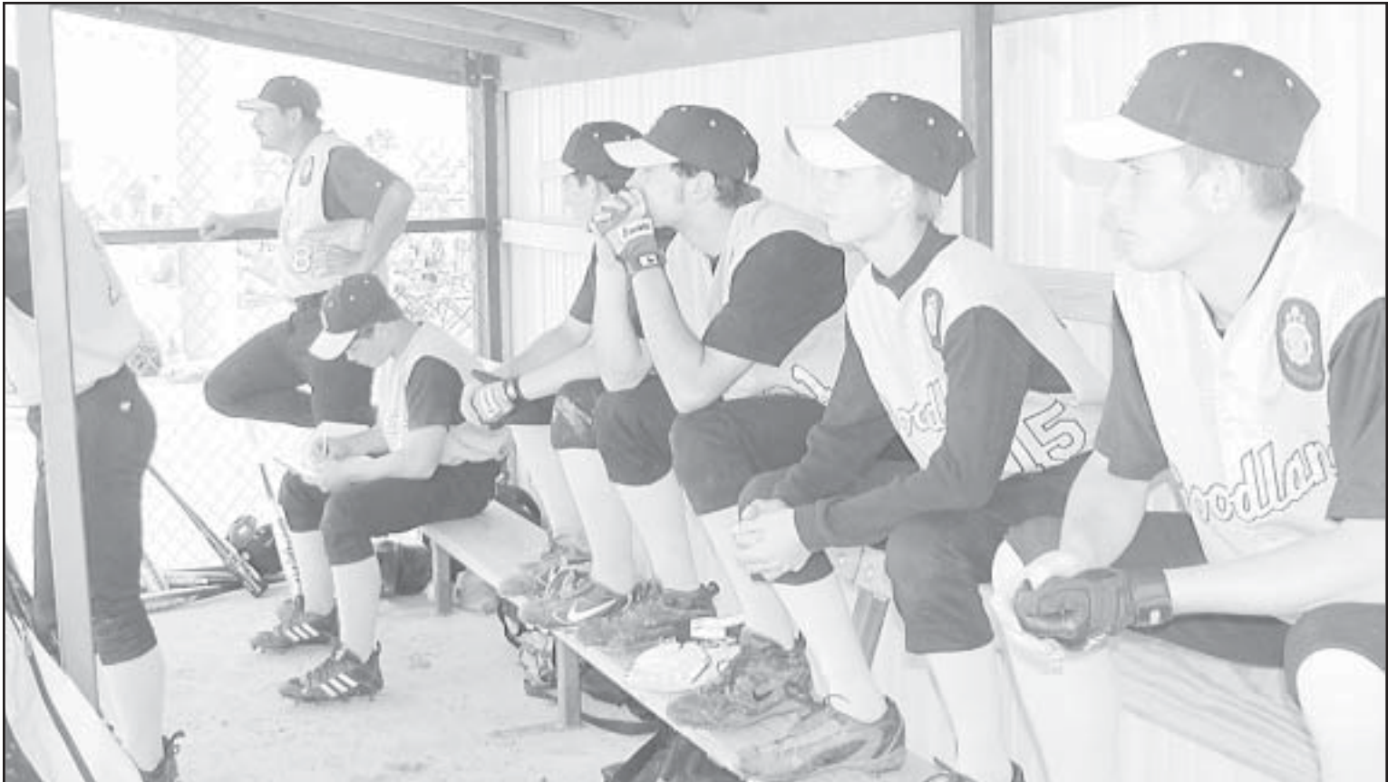
Goodland players and coaches watched their teammates play defense during the bottom of the first inning against Imperial Saturday afternoon.