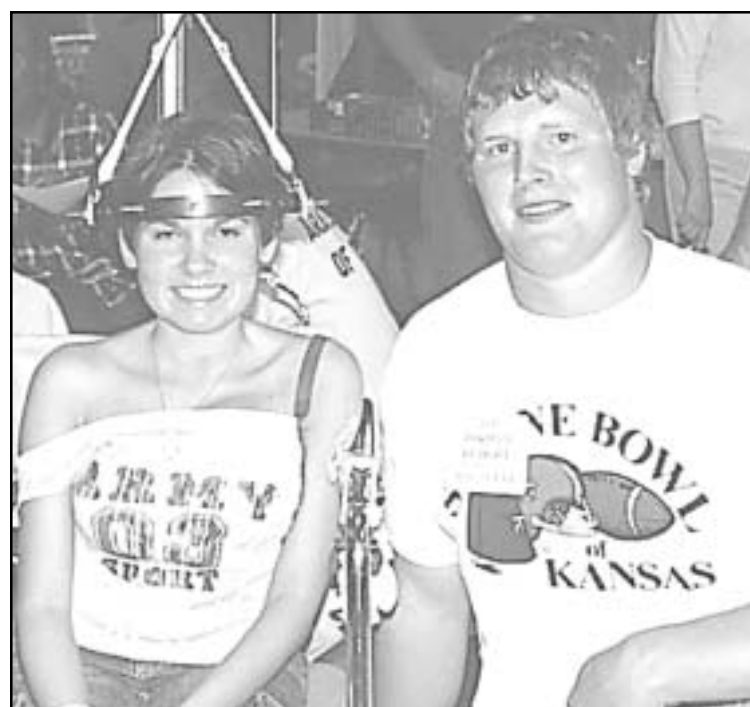
Photo from Kansas Shrine Bowl