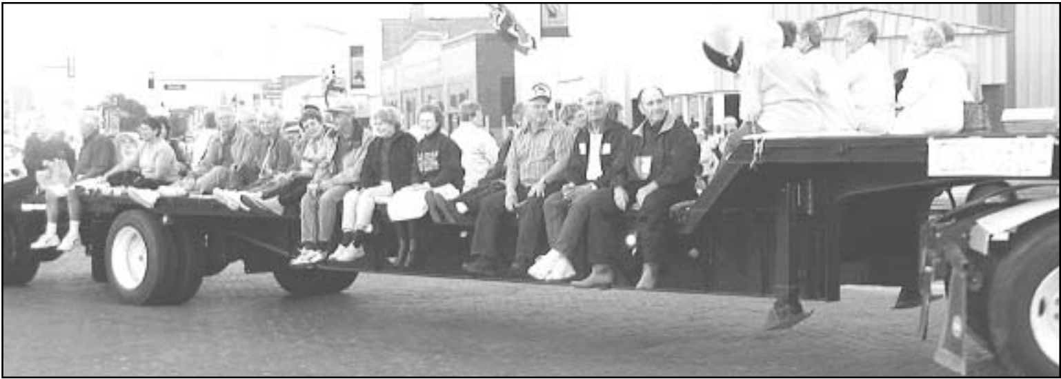
The honored class of 1954 rode a flatbed trailer in the Homecoming parade Thursday night. The parade wandered south on Main, turning at 13th Street and continuing to the high school. The celebration featured the marching band, the "Jumping Juniors," sports teams and floats.