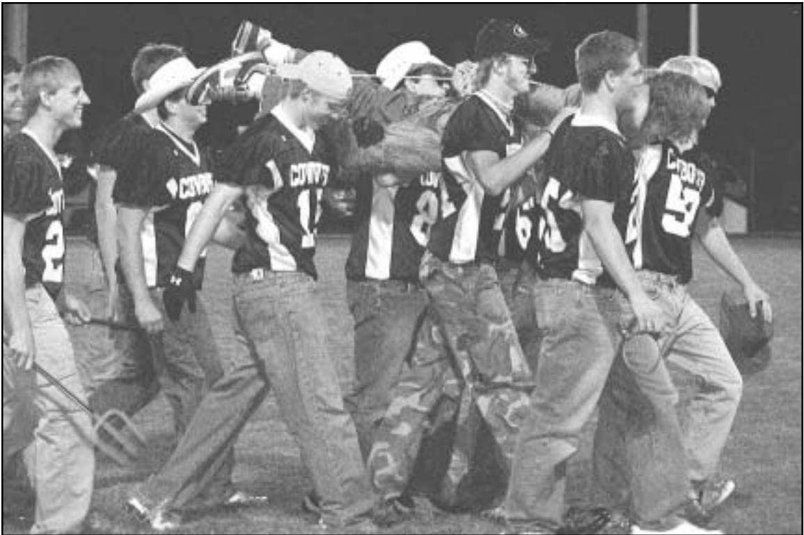
Goodland High football seniors tackled and wrangled a person dressed up like a Red Devil, the Oberlin mascot, in a skit at the homecoming pep rally Thursday. The team rode into the stadium on all-terrain vehicles and introduced themselves.