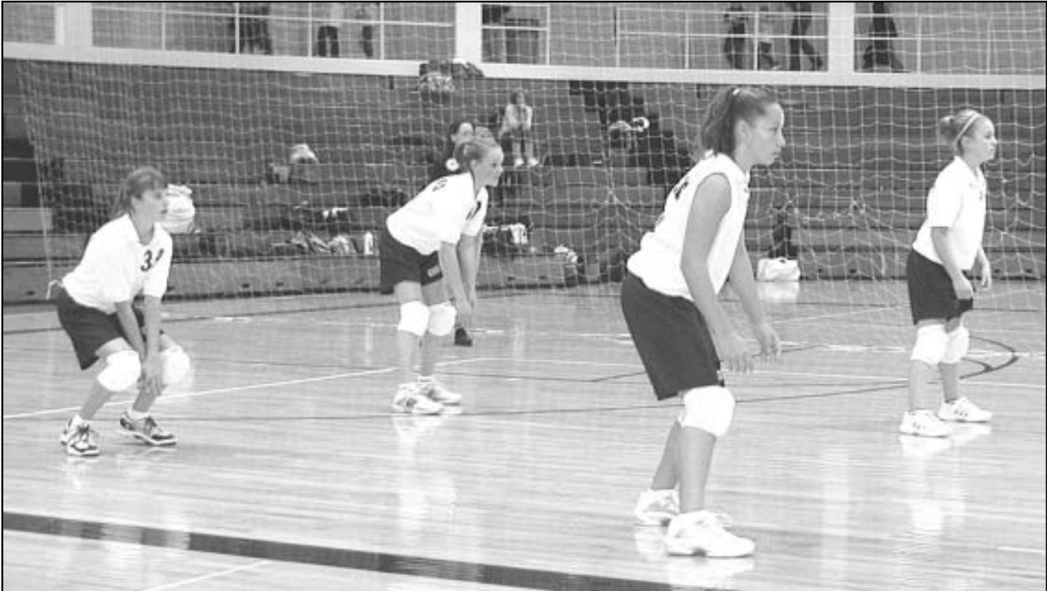
Lady Mustangs split with Felton Middle School Falcons