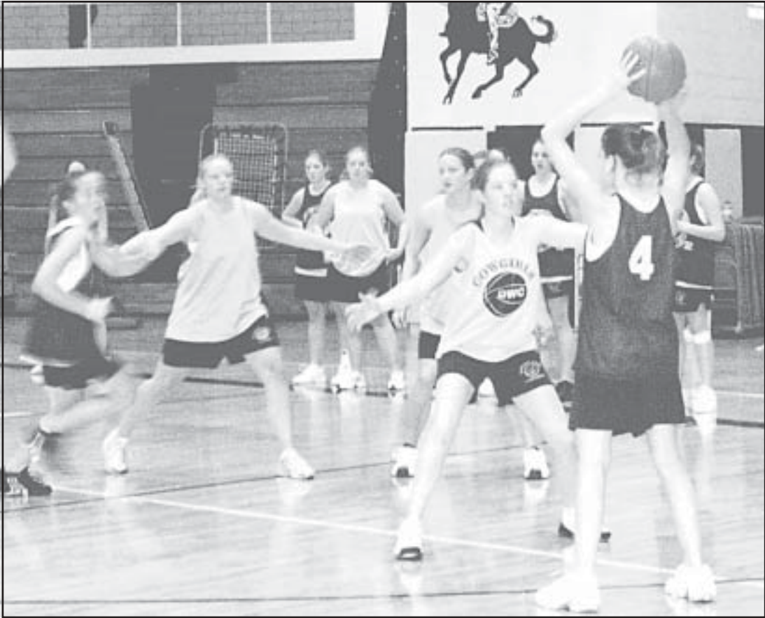
The Goodland Cowgirls basketball team worked out Wednesday afternoon during practice. The Cowgirls, who finished 9-12 last season, will play an intrasquad scrimmage starting at 6:30 p.m. next Tuesday at Max Jones Fieldhouse. They open the regular season at home on Friday, Dec. 3, against the Lady Longhorns of Chase County High School from Imperial, Neb.