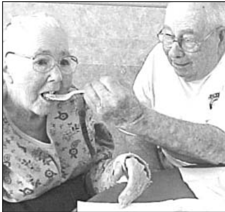
bite of their cake Thursday, March 31, 2005, when they celebrated their 65th anniversary at the center.