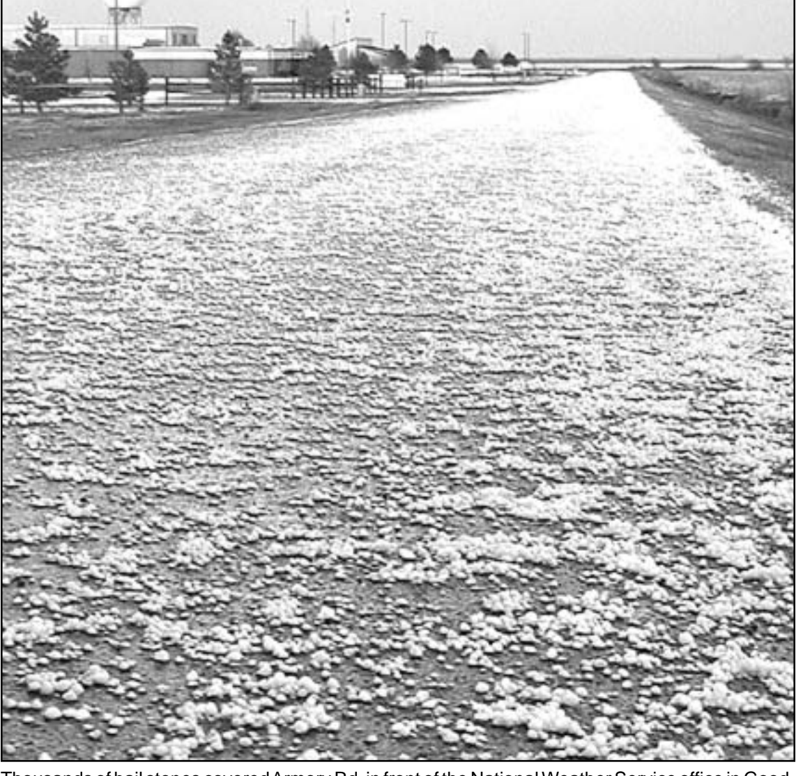
Thousands of hail stones covered Armory Rd. in front of the National Weather Service office in Goodland after a severe storm moved through town Wednesday.