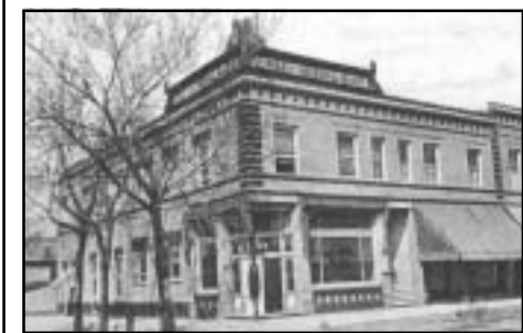
First National Bank of Lamar in 1928