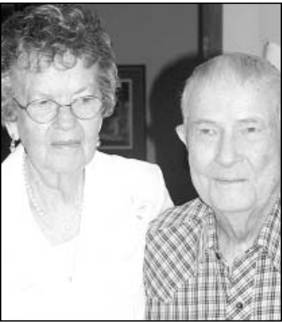
The couple today