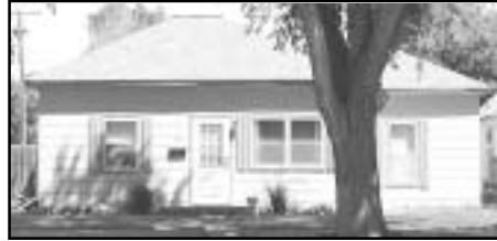
New Listing 324 W. 10th $75,000

Completely remodeled interior! Main floor offers large living room, dining room, kitchen, three bedrooms, two baths. The basement is finished with family room and another bedroom. Master bedroom is 15x16' with a huge walk in closet. New central heat and air, new sprinkler system plus lots more.