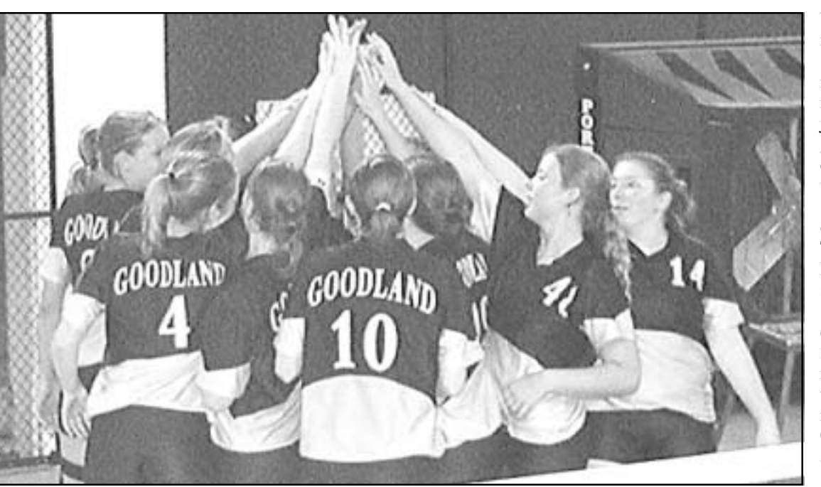
The Cowgirls varsity did some self-morale boosting while waiting for the Burlington/Thomas More Prep-Marian match to finish during Tuesday's quadrangular meet at Max Jones Fieldhouse.