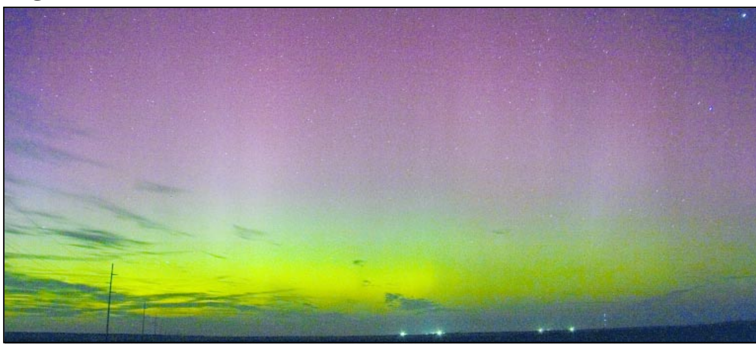
The aurora borealis, or northern lights, was seen dancing across the sky Saturday night just four miles east of Goodland. The display was caused by the fourth largest solar flare in the past 15

years, which created a severe geomagnetic storm. More photos and an in-depth explanation of the event are available at www.crh.noaa.gov/gld/news/2005/aurora.php .