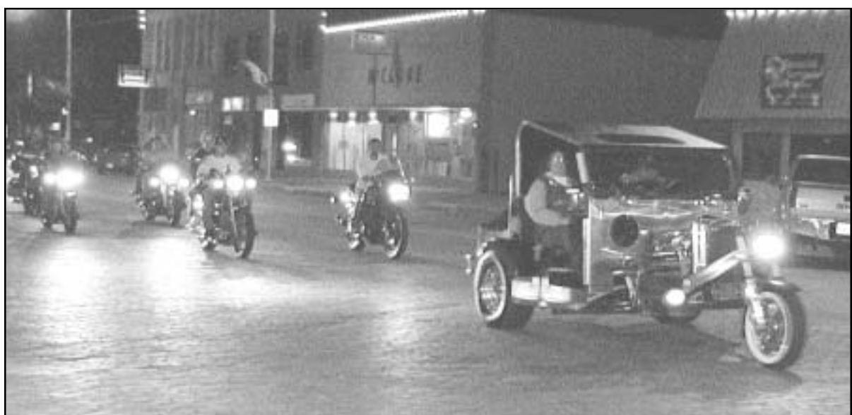
The motorcycle parade at 8 p.m. on Saturday has become an annual event that lines Main with people watching the lines of bikes as they parade.