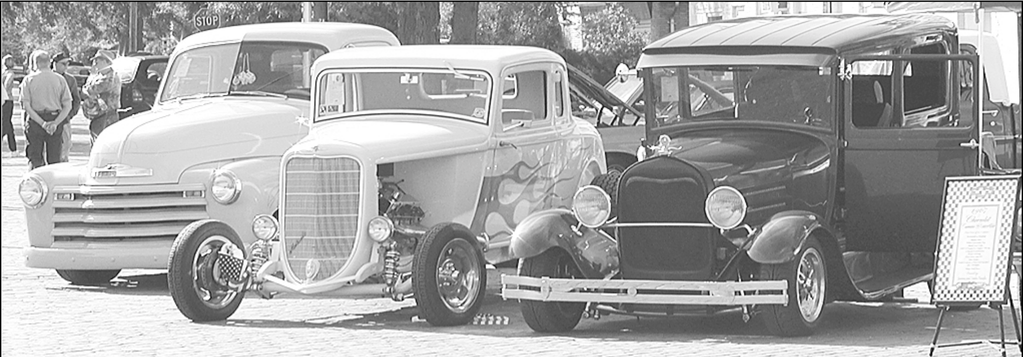
The street in front of Central School was crammed with hot rods for the Early Iron Rod Run show last year. Central School will be the headquarters for the car show this year.