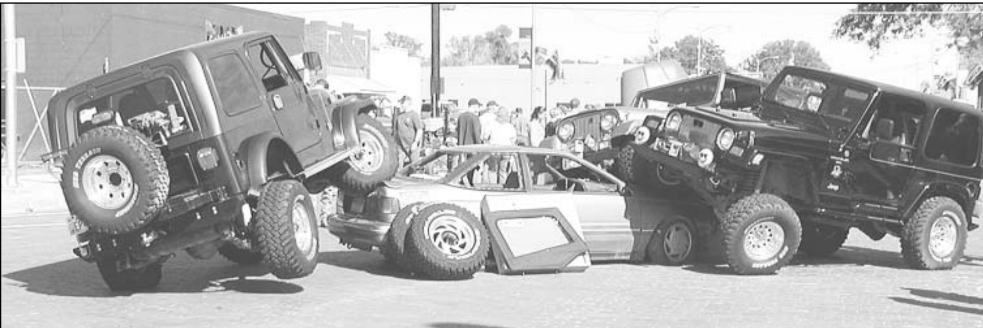
On the south side of Main at last year's Fall Flatlander Festival, two Jeeps were driven up on top of a car. A jeep show is planned for this years events. The street in front of Central School was crammed with hot rods for the show.