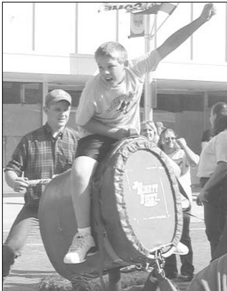
Kids had fun last year riding the bucking bull. This is one of the many rides and games set up by the Northwest Kansas Technical College.

Enjoy Flatlander's While in Town Tune us in.