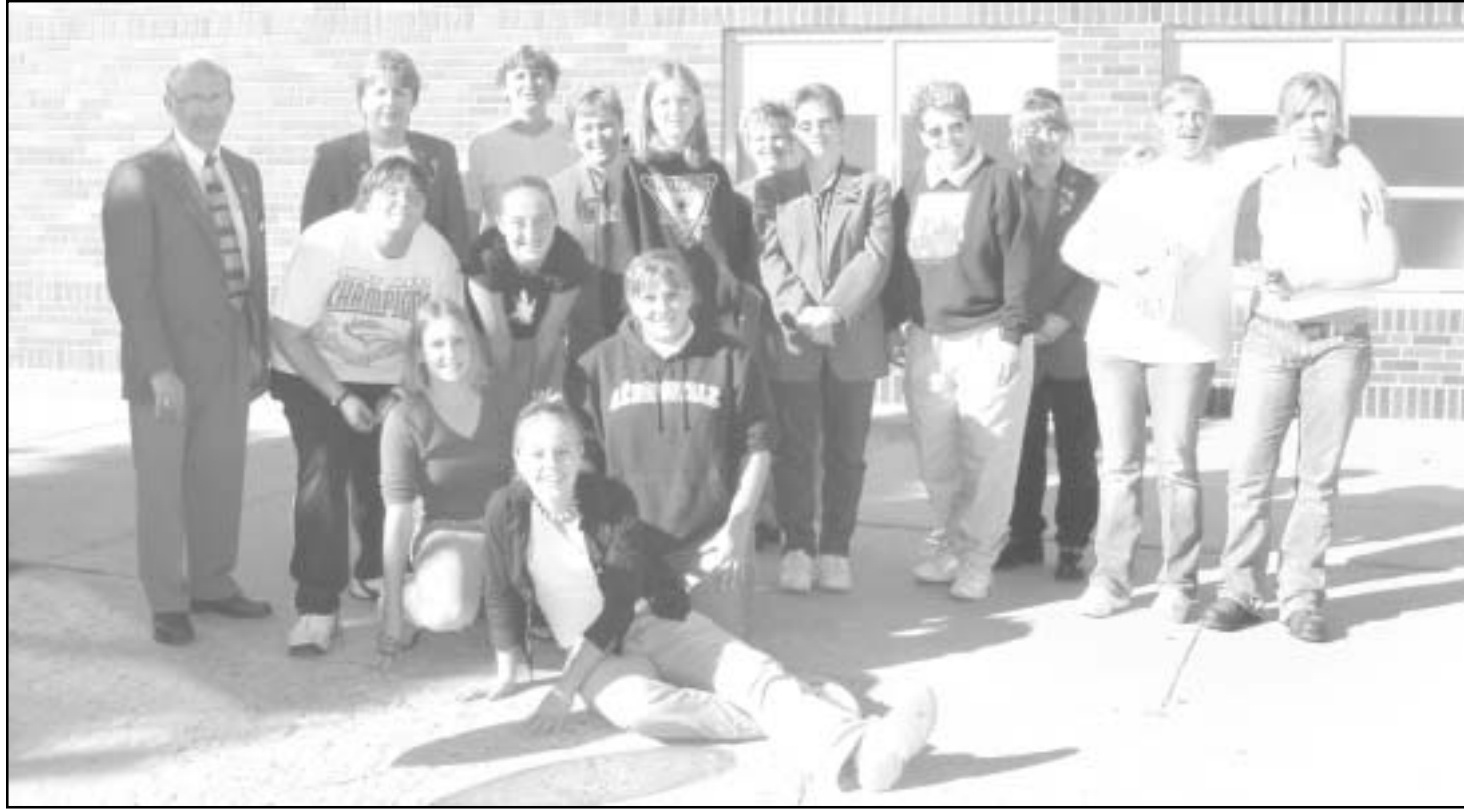
The Cowgirls golf team got a congratulatory sendoff Friday after school from Goodland's Ambassadors. The team left Sunday morning for its first-ever state tournament being held Monday in Andover.