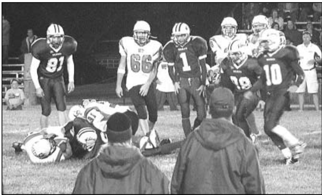
The Wildcats tackled a ball carrier from Golden Plains High Friday night in Sharon Springs. The 'Cats of Wallace County High defeated the Bulldogs from Rexford 28-14 in 8-man football action within the Western Kansas Liberty League.