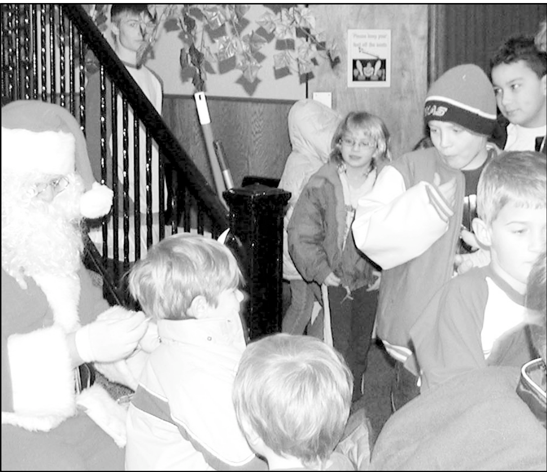
Santa passed out candy and met kids as they left the free matinee at the Sherman Theatre on Saturday. Santa had a busy day, as he was at the Veterans of Foreign Wars when candy was passed out, at the Christmas on Us Drawing sponsored by the The Goodland Star-News and at several businesses. Free movies were part of the Christmas activities planned by merchants.