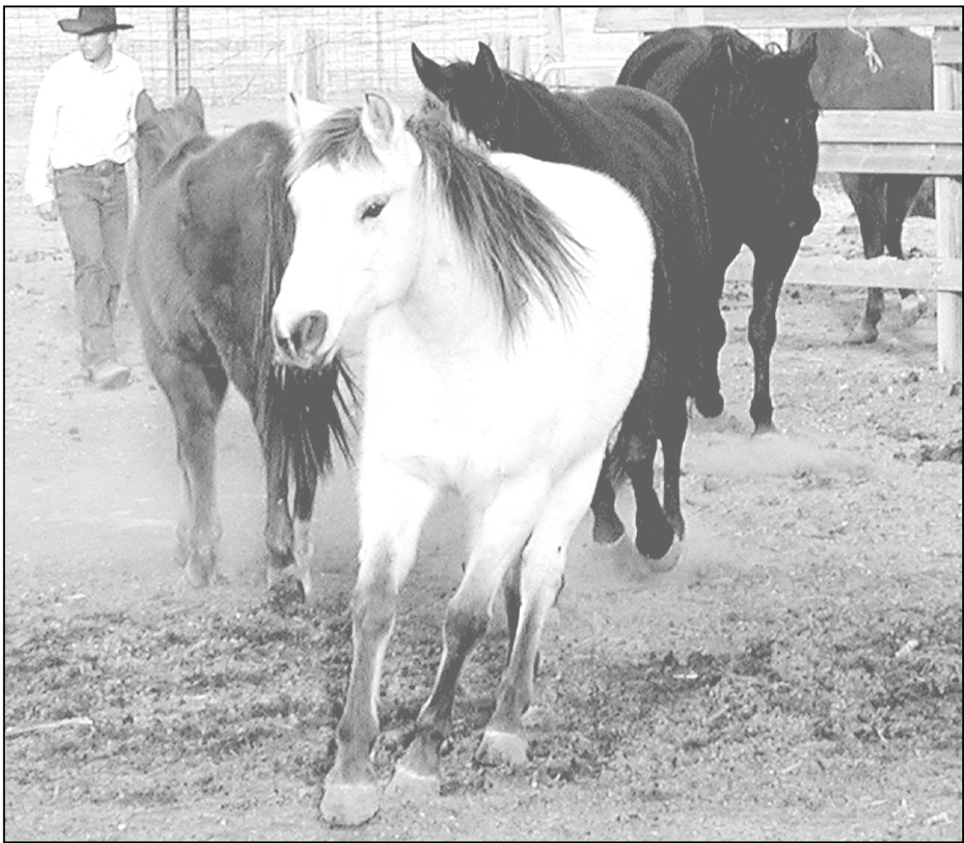
Horses that will be auctioned on Monday at Colby Livestock Auction were seized at 6975 K-27, north of Goodland, by Sherman County sheriff's officers on Feb. 28 after allegedly being found without food or water.

The sale barn is at 125 S. Country Club Drive, Colby, past the railroad tracks south of U.S. 24.