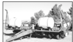
'84 John Deere MaxEmerge 2 Planter, 7200 w/fertilizer attachment, 8 row, finger row cleaners, 250 monitor