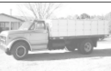
'68 Chevy Truck, 15 ft. steel box & hoist, new tires, 4x2 trans., V8, 10 R 22.5 triple hydraulics

IMPLEMENTS: 1984 Bush Hog Disc, 24 ft., 9 in. space; 1996 Crust Buster Drill, 3400 all plant, dual markers, DD 36x10, 30 ft.; 2000 Wylie Sprayer, 60 ft. boom, Raven monitor; Case Chisel, 15 ft.; John Deere Ripper, 9 shank; Lilliston Melroe 284, 12 ft. Drill with 12 in. spacing; Melroe Farm Hand Viber Coil 5 Section Harrow; Miller Rod, 32 ft.; Miller Sweep Plow, 5x7 with pickers; Noble Sweep, 4x6 with fertilizer attachment, with pickers; Schaffer 2-way Disc, 24 in. blades, 9 in. spacing; Stanhoist Harrow with drag Harrows, 40 ft.