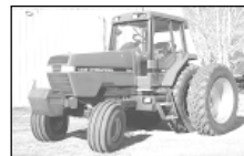
'89 Case Tractor 7130, 3 pt., 18 speed hi-low, 18.4 R 2