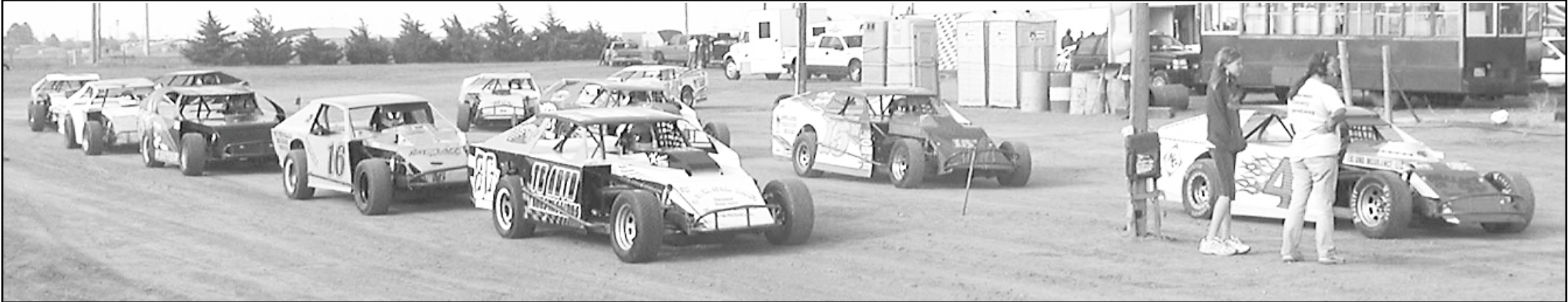
Drivers lined up for the start of one of the early heats in the Modified class at the Sherman County Speedway to open Goodland's 2006 stock car season Saturday, May 6. The drivers will take the oval track again starting at 6:30 p.m. Saturday at the speedway. Classes include mini stock, econo, bomber, stock and modified.