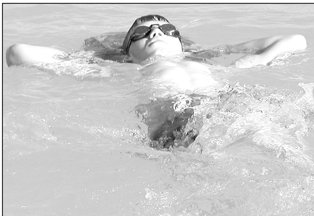
The Goodland Swim Team began practice Tuesday afternoon. Their first meet will be Saturday, June 3, out of town. The home meet in Goodland will be on Saturday, June 10.