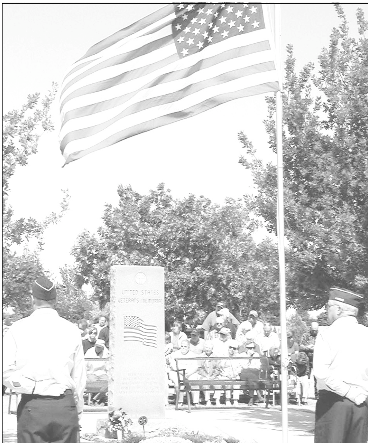
The sun was shining Monday, but the wind was blowing about 20 mph as more than 150 people gathered at the Goodland Cemetery for the Memorial Day service put on by the Veterans of Foreign Wars, Veterans of Foreign Wars Auxiliary, the American Legion and the Kansas National Guard.