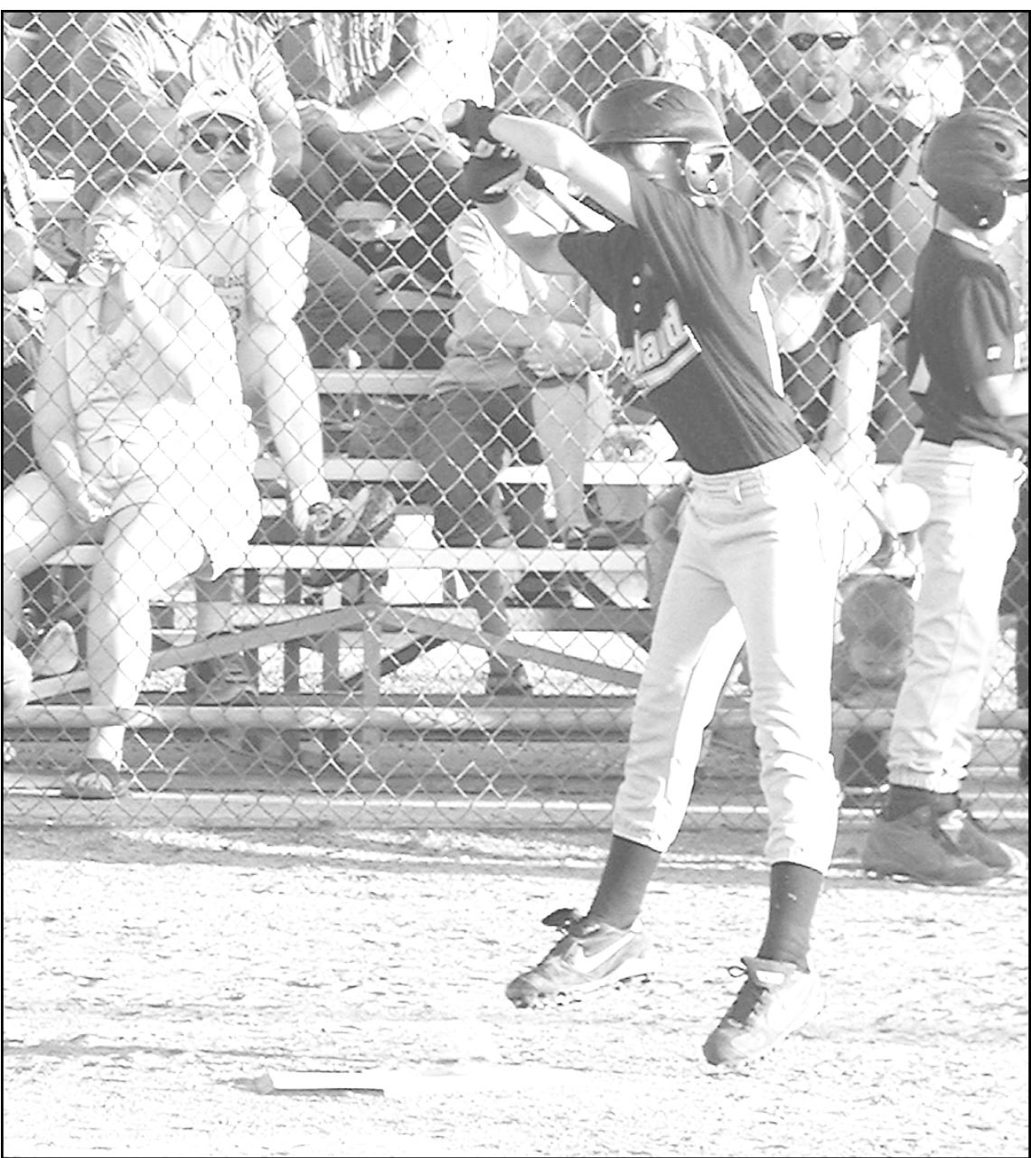
A batter for the Rough Riders jumped out of the way of a ball in a game Tuesday night against Sharon Springs. The team plays its next game tonight against Grainfield at the Centennial Ball Complex.