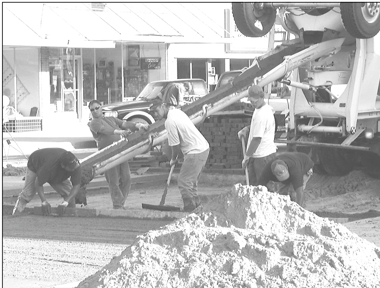
Workers from Miller Construction smoothed cement from Schlosser's Concrete at the corner of 12th and Main. The last of the cement was poured on Friday morning. The bricks will arrive in August.