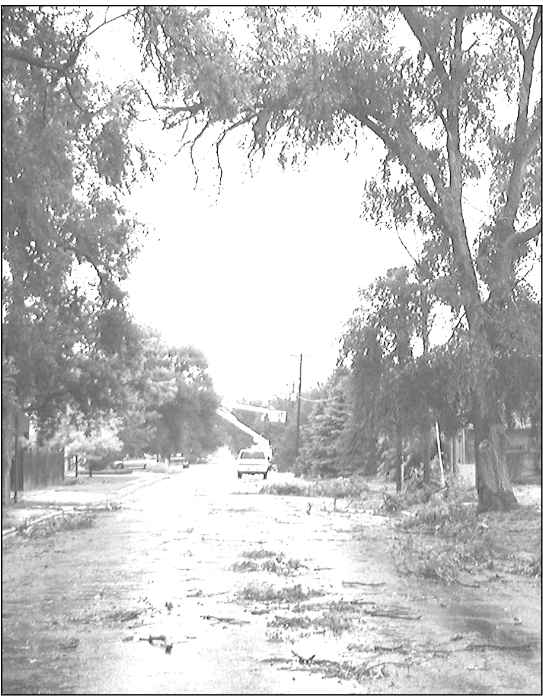
A look down 14th Street showed branches and a City of Goodland crew working on power lines during the storm on Friday.

A fire was reported at 2690 old U.S. 24, about seven miles east of Goodland, around 3 p.m. at the Keith Kenny place. The rural fire department responded, but the flames consumed an out building.