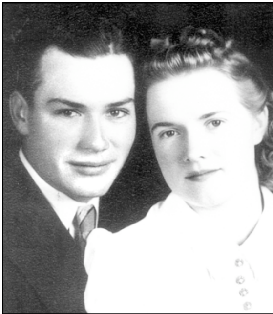
The Todds then