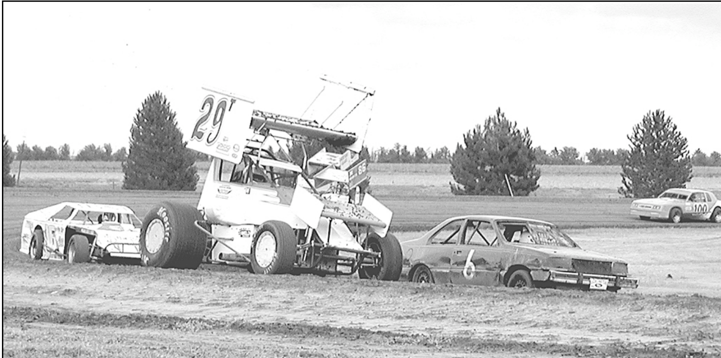
Sprint Cars shared the Sherman County Speedway with the Modifieds, Bombers, Stock and Econo cars Saturday to thrill the crowd with dirt track racing. The racers will be back in action at 6:30 p.m. on Saturday, Sept. 2.