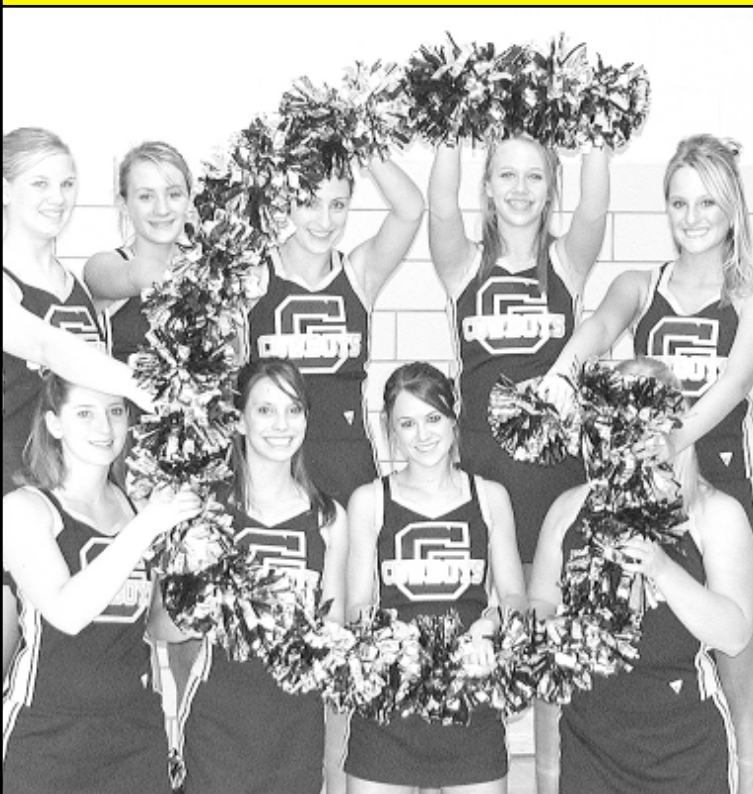
Give us a "G"