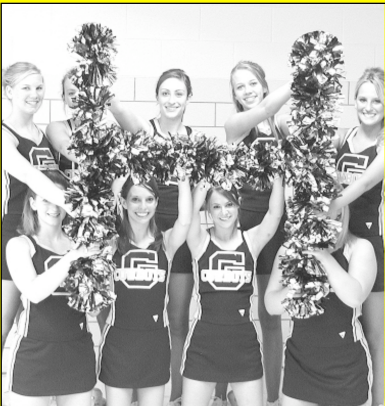
Give us an "H"