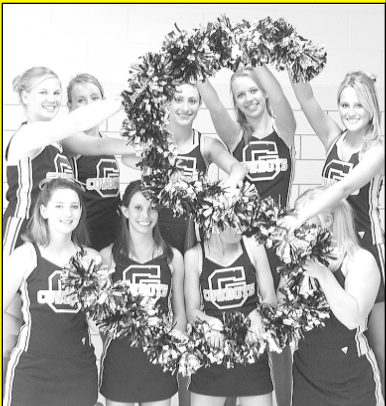
Give us an "S"