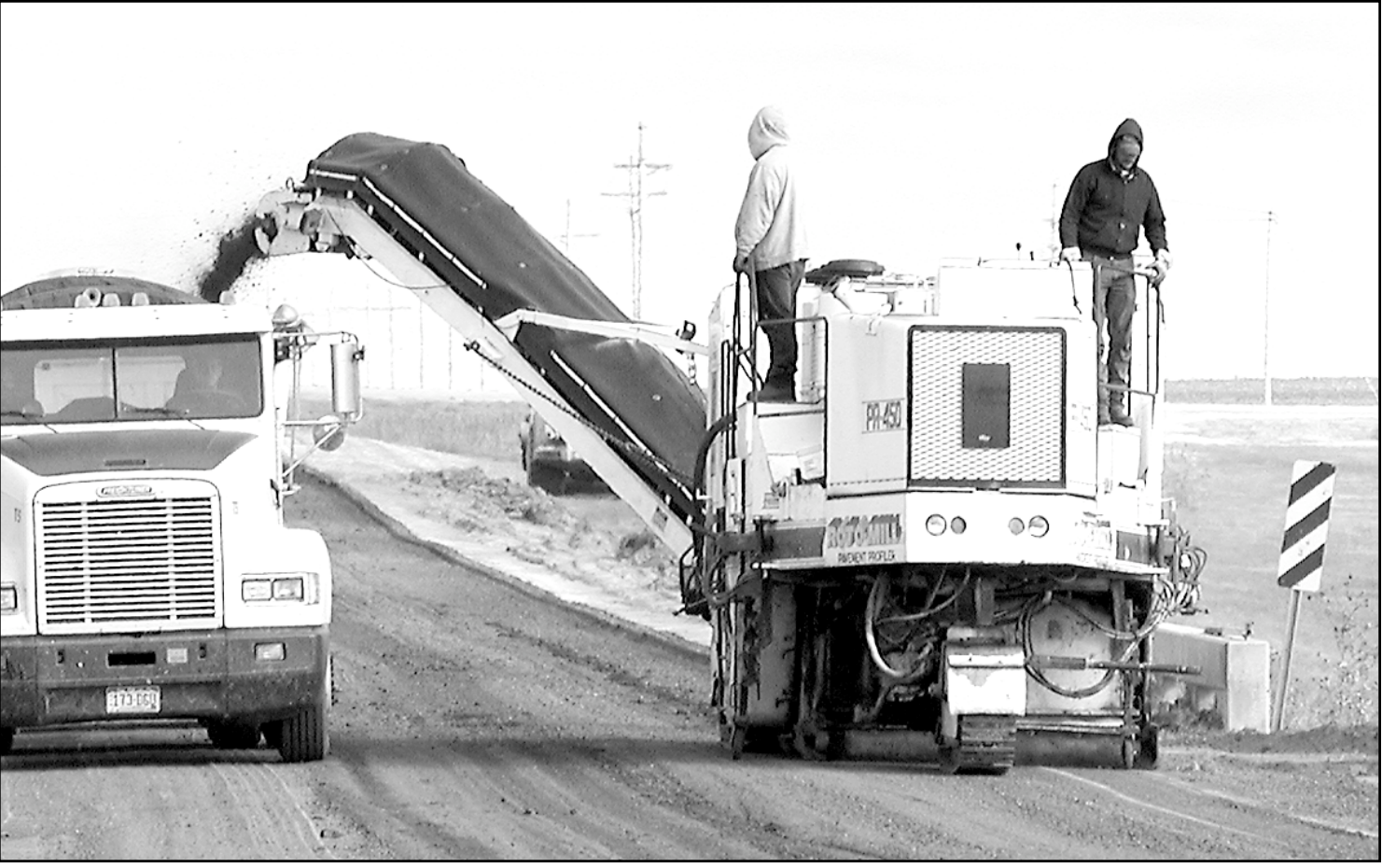
A crew from Grasser Construction of Stratton, Colo. milled off the old pavement as the first step in redoing a section of North Caldwell from the airport entrance north to County Road 67. The

$347,063 project will put new pavement in place, plus replace the approaches to the bridge over Sappa Creek with concrete. The road will be closed for six to eight weeks.