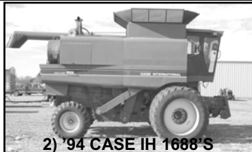
2) '94 CASE IH 1688'S