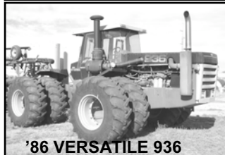
'86 VERSATILE 936

AUCTION LOCATION: From I-70 exit 19 at Goodland, KS, go ½ mile North, then ½ mile East on old Hwy 24