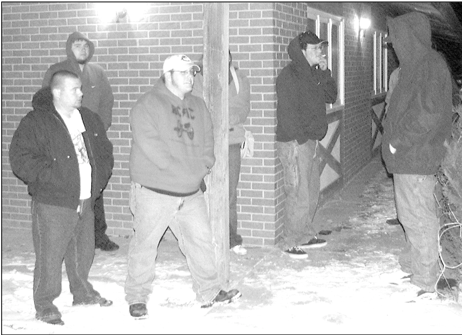
Students stood out in the cold Thursday night as Kansas Highway Patrol dogs searched the Northwest Kansas Technical College