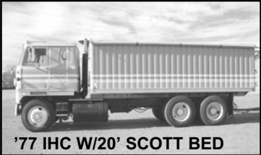
'77 IHC W/20' SCOTT BED