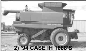
2) '94 CASE IH 1688'S