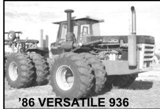
'86 VERSATILE 936

AUCTION LOCATION: From I-70 exit 19 at Goodland, KS, go ½ mile North, then ½ mile East on old Hwy 24