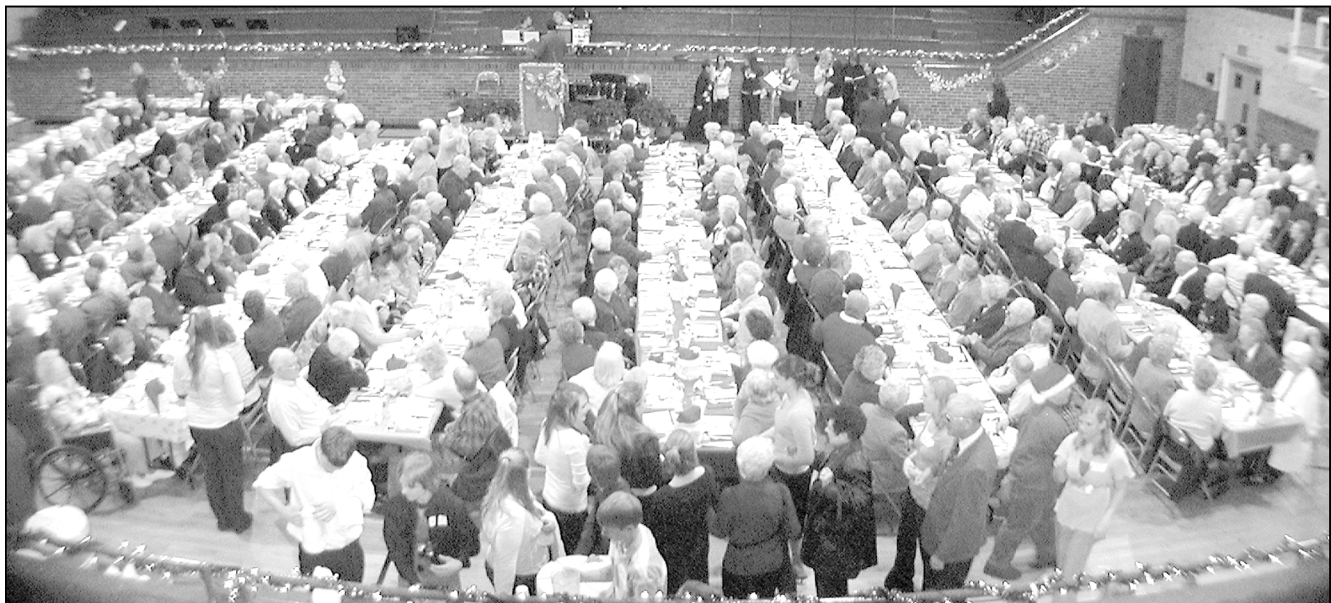
The annual Sherman County Senior Citizen Holiday Dinner was held in the Goodland High School gym on Wednesday. The Family, Career and Community Leaders of America, American Field Service and National Honor Society members hosted the 405 diners for a traditional holiday dinner.