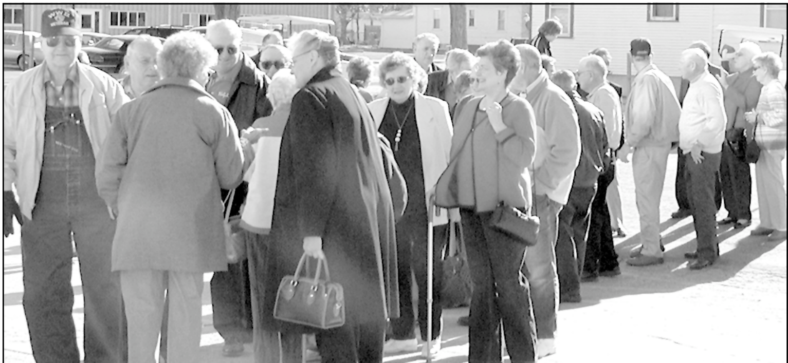
The waiting line at times went to where people got out of their cars for the senior holiday dinner held at the Goodland High School gym on Wednesday. Students parked the cars for diners and escorted them in.